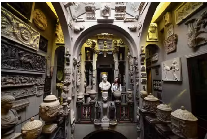
London's best museum lates 2023