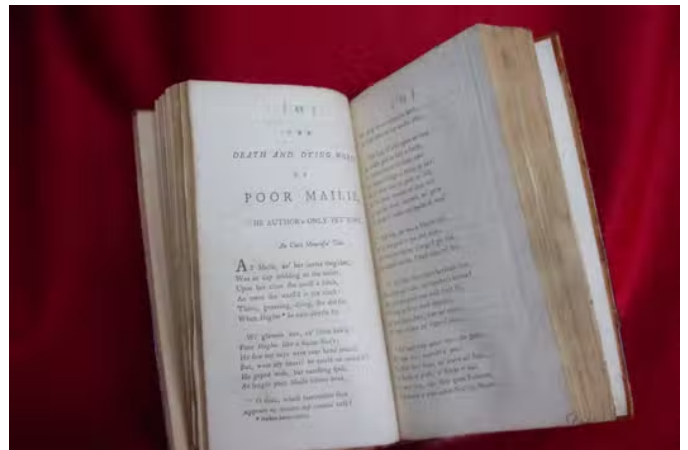
Rare Robert Burns book saved from destruction to go on display